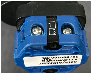
KEY SWITCH TERMINALS

green/earth brown/close black/open grey/common